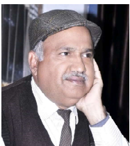
By: Vijay GarG

about their future careers, even basic gender stereotyping about jobs and mirror professions in high regard similar to their parents' views.