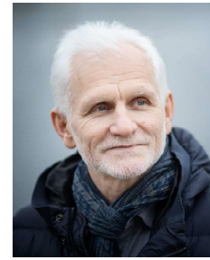
Nobel Peace Prize for 2022 - Ales Bialiatski

which advocates for political prisoners and in response to the controversial constitutional amendments that gave the president dictatorial powers and that triggered widespread demonstrations. Viasna evolved into broad-based human rights organization that documented and protested against the authorities' use of torture against political prisoners. Government authorities have repeatedly sought to silence Ales Bialiatski. He was imprisoned from 2011 to 2014. He was himself detained in 2020 following protests against the re-election of Belarus' strongman leader Alexander Lukashenko, a close ally of Putin. He remains in jail without trial. Despite tremendous personal hardship, Mr Bialiatski has not yielded an inch in his fight for human rights and democracy in Belarus. In a statement on its website, Viasna noted that this was Bialiatski's sixth nomination for the award, and that he is the fourth winner to have received the Nobel Peace Prize while in custody.